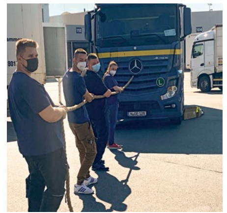
Geis Eurocargo Nuremberg, professional drivers