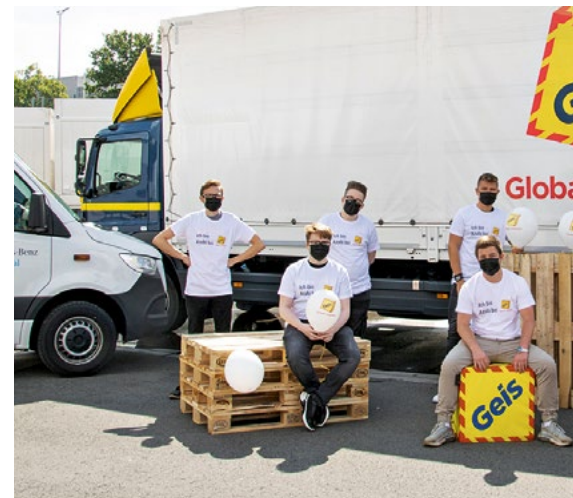
Geis Eurocargo Ohrdruf

In total, 317 apprentices are learning a profession with us. In addition, there are eleven dual degree students.