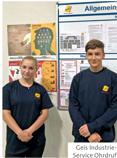
Geis Industrie-Service Ohrdruf