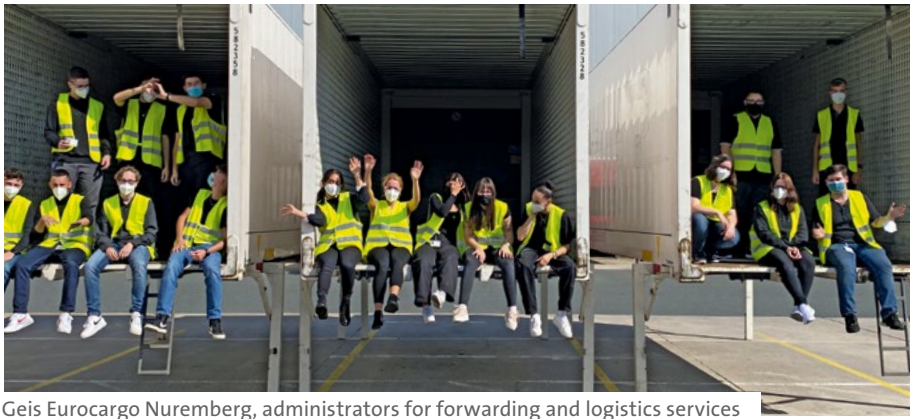
Geis Eurocargo Nuremberg, administrators for forwarding and logistics services