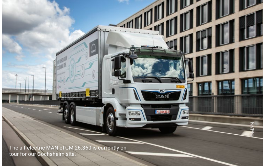
The all-electric MAN eTGM 26.360 is currently on tour for our Gochsheim site.

More information: schweiz.road@geis-group.de