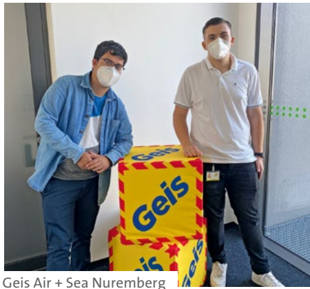
Geis Air + Sea Nuremberg