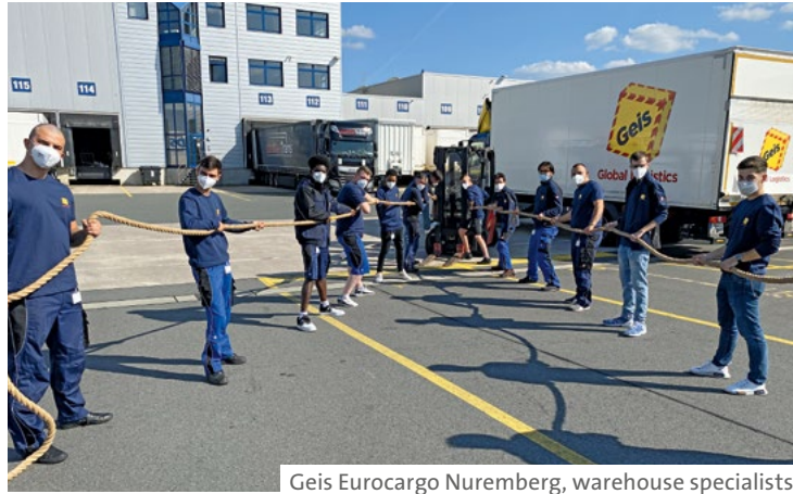
Geis Eurocargo Nuremberg, warehouse specialists