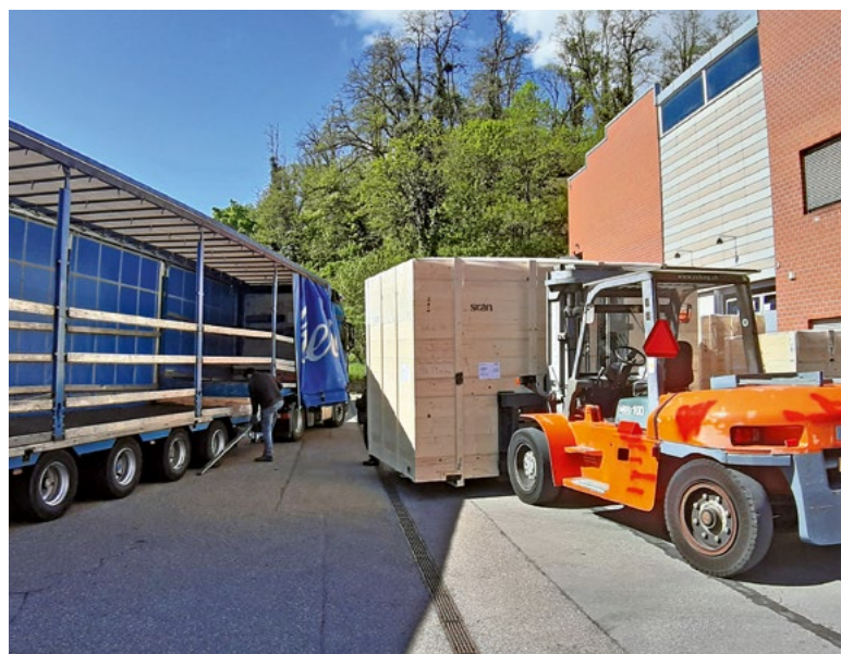
We picked up the securely packed vaccine filling line from the SKAN AG plant in Allschwil just outside Basel, and transported it to the USA by charter flights.

“Against all odds, we delivered the plant on schedule. In this way, we were all able to make an important joint contribution to combating the Covid pandemic,” says a delighted Emre Karadeniz, our Site Manager Basel Airport.