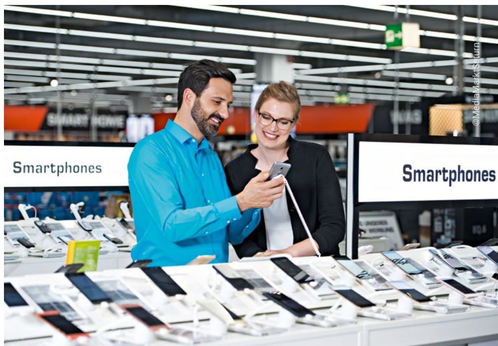
In future, all German MediaMarkt and Saturn stores will receive their merchandise from the new central warehouse.

Our activities include the complete warehouse logistics within the supply chain: receiving goods from suppliers, storing them as well as picking and packing them according to demand and departmental needs for on-time delivery to the stores and online partners (such as Redcoon). Our