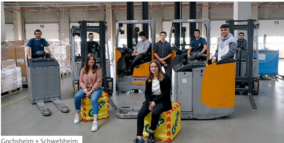
Gochsheim + Schwebheim